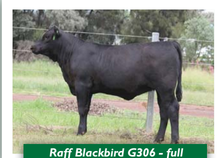
Raff Blackbird G306 - full sister to Hercules pictured at 7 months when sold at auction for $17,000