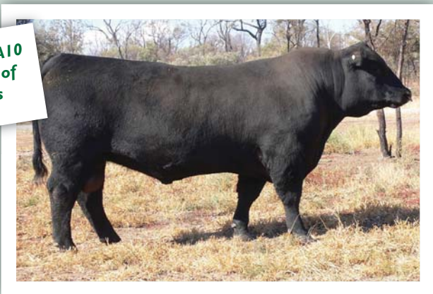
J&C Appeal A10 - grandsire of Hercules