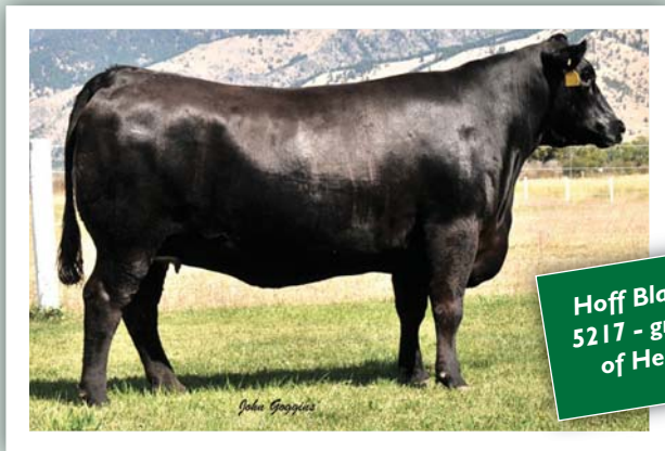
Hoff Blackbird 5217 - grandam of Hercules