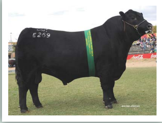
Raff Empire E269 ~ 2011 Brisbane Royal Show when 23 months weighing 1150kg.