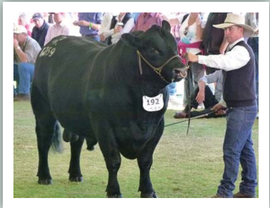
Raff Empire E269 - Supreme Beef Exhibit of the Show 11 times including Sydney, Melbourne and Rockhampton.