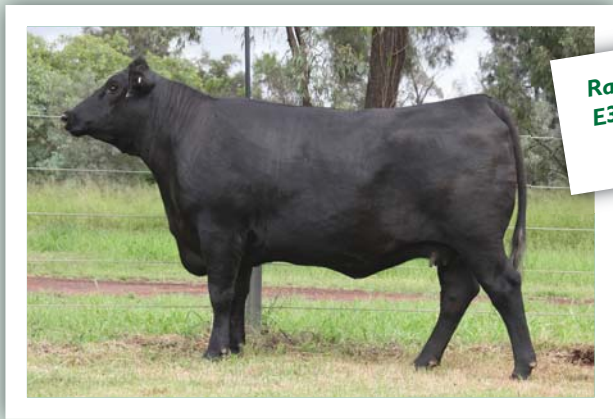
Raff Blackbird E305 - dam of Hercules