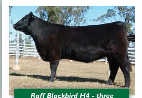
Raff Blackbird H4 - three quarter sister to Hercules. At 23 months she weighed 766kg.