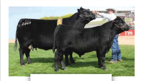
Raff Blackbird D349 the half-sister to the dam of Hercules. Supreme Champion Inter-breed Female 2012 Brisbane Royal Show.