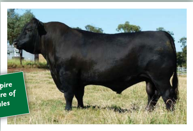
Raff Empire E269 - sire of Hercules